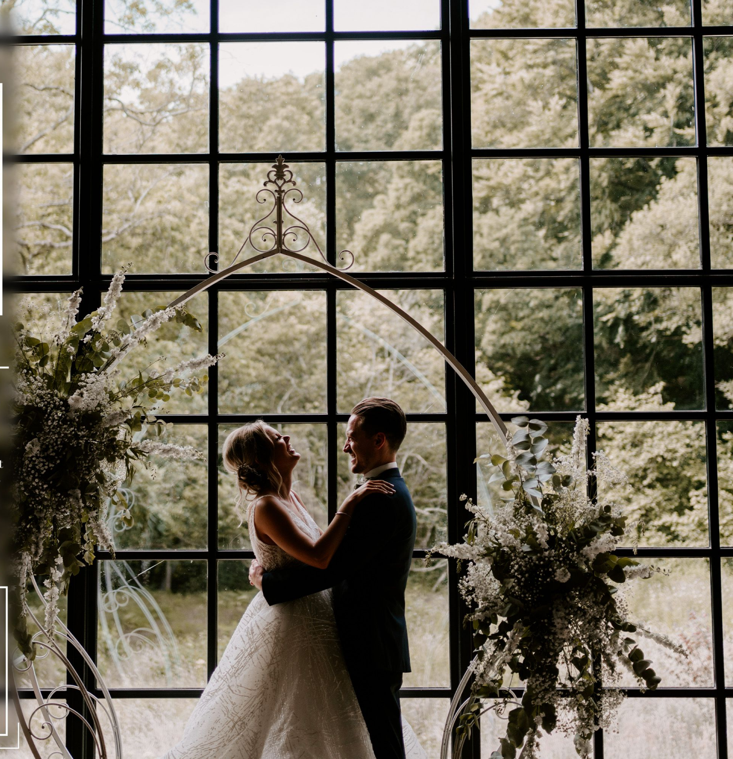
Photo & Video team has become our most popular package simply due to the fact that it solves all of those issues. We've perfected our workflow to capture in sync while never missing a shot. We travel together, work together and edit together. (the discount also helps...)

We know that a lot of modern couples need both photography and videography at their wedding. Finding two separate companies that match in both style & price can be a difficult task. Work-flows can also often clash between two people who've never worked together.